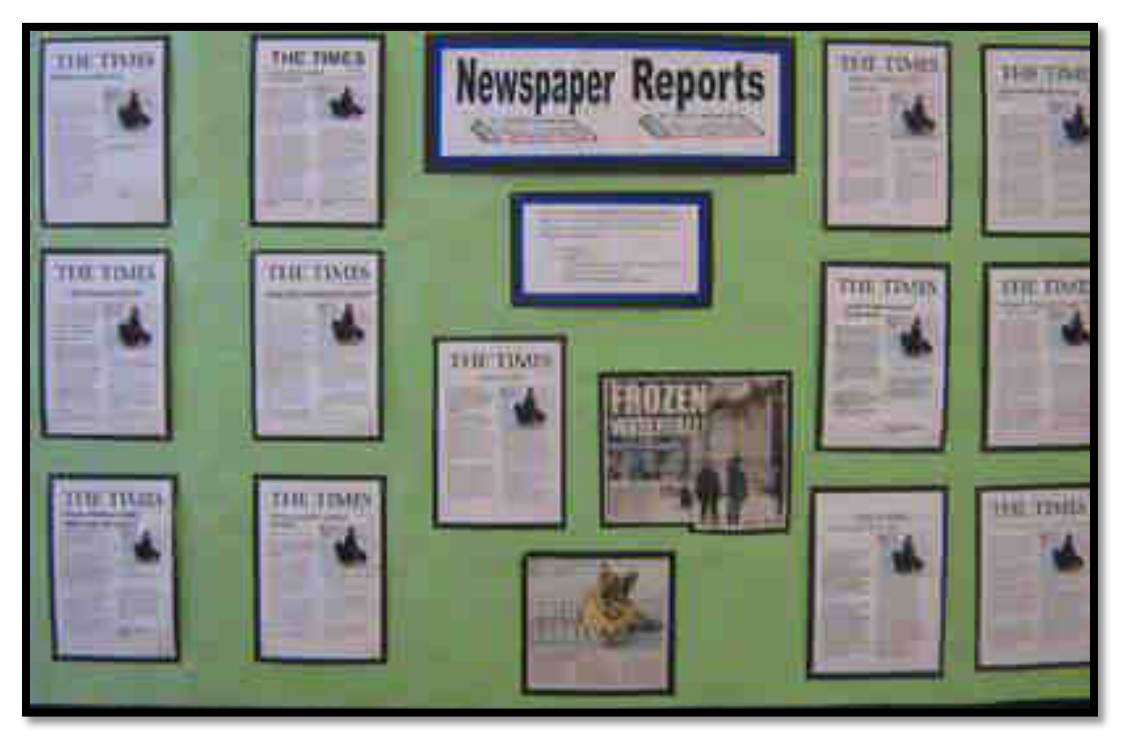
Bulletin boards with newspaper cuttings