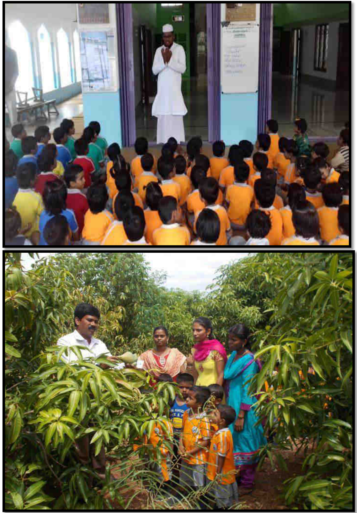
Kg's Field Trip – 28<sup>th</sup> August, 2019.

Literature can be distributed to students on consumer Redressal and Standardization marks.