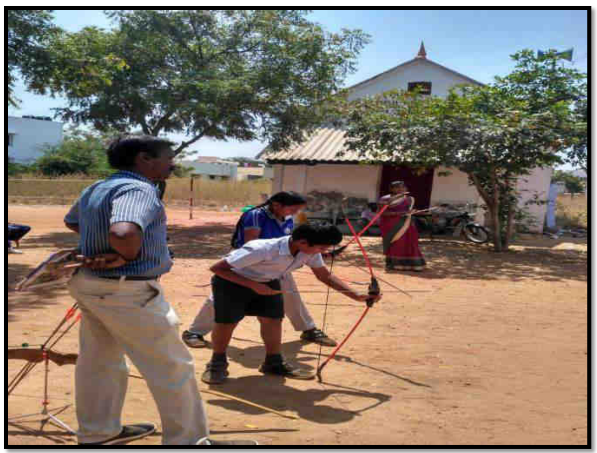
Inter school and Intra-school competitions