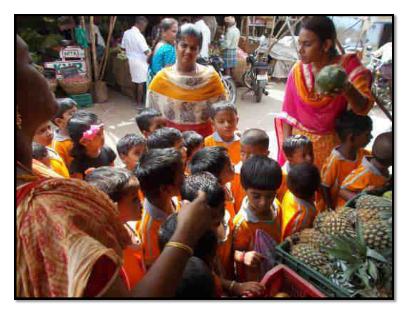
Kg's Field Trip – 28<sup>th</sup> August, 2019. Primary Field Trip – 30<sup>th</sup> August, 2019.